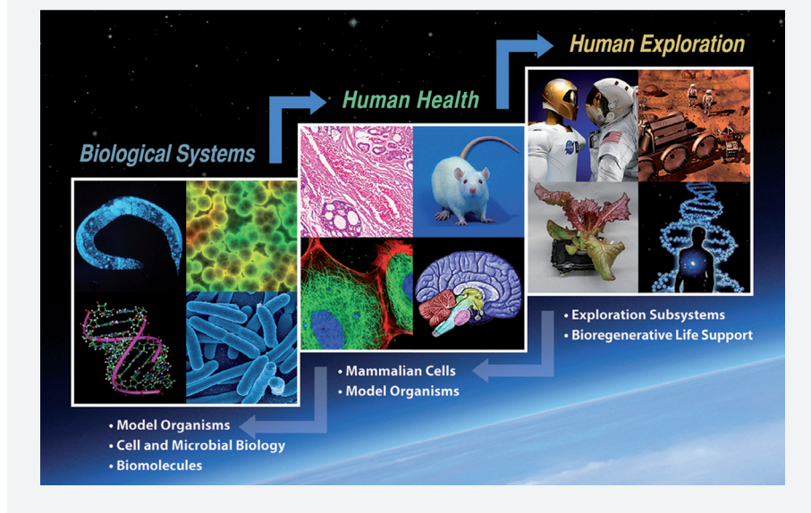
FIGURE 2 —The NASA Life Sciences Translational Path. It moves from basic research to human exploration applications with bi-directionality options. As knowledge is applied along this path (top arrows) questions may arise that can best be addressed by more basic research (bottom arrows) in order to support further progress toward successful human exploration (taken from Alwood et al., 2017).

of a true “space agriculture” is a fundamental objective of this global enterprise and it requires a full knowledge of the effects of the space environment on the plant biological mechanisms and the adaptive processes and counter-measures necessary to guarantee plant survival in these alien environments (Medina 2021; Figure 3).